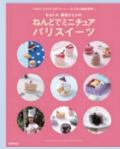
ねんど岡田ひとみの ねんどでミニチュア パリスイーツ (主婦の友社)