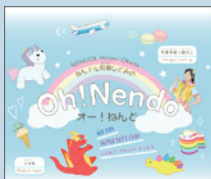
オー！ねんど 【ねんど教室でもよく使用する とっても使いやすい軽量ねんど】