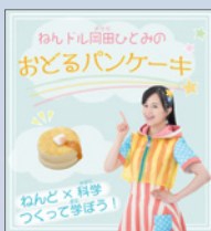
形状記憶合金 LABO おどるパンケーキ (吉見製作所)