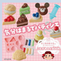
不二家洋菓子店の ケーキをつくらう！ こむぎねんど BOOK (宝島社)