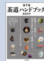
裏千家 茶道ハンドブック 北見宗幸著 (山と溪谷社)