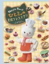
ねんどキャットひとみとの まほうのレストラン 【いりやまとしとのコラボ レーション絵本】(学研プラス)