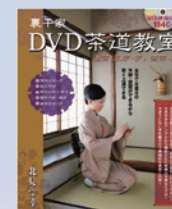
裏千家 DVD 茶道教室 濃茶 (風戸・炉) 薄茶・炉 北見宗幸著 (山と溪谷社)