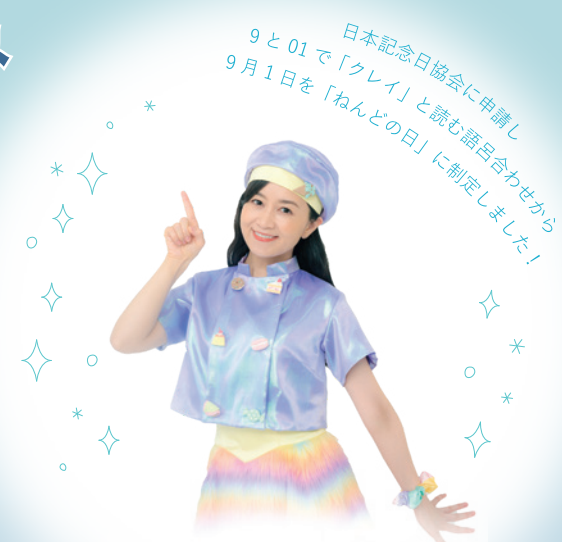
写真：池田 晶紀 (ゆかい) 2025_2 ©CHEESE

日本記念日協会に申請し 9と01で「クレイ」と読む語呂合わせから 9月1日を「ねんどの日」に制定しました！