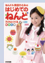
ねんど岡田ひとみの はじめてのねんど 子どもとつくる年中行事 (鈴木出版)