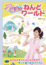
ねんど岡田ひとみの 魔法のねんどワールド (じゃこめてい出版)