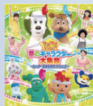
ワンワンといっしょ！ 夢のキャラクター大集合 ～センターを取るの、だれだ！？～ 【DVD&Blu-ray】(日本コロムビア)