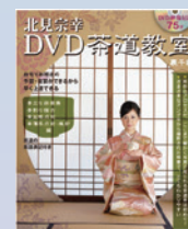
北見宗幸 DVD 茶道教室 裏千家 (山と溪谷社)