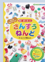
プレNEO ブックス さんすうねんど (小学館)