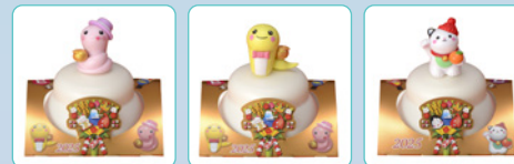
お鏡餅キャラクター 2025 年干支の「巳」、 「招き猫にゃあ」の全3種 (越後製菓)