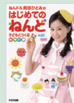
ねんど岡田ひとみの はじめてのねんど 子どもとつくる年中行事 (鈴木出版)