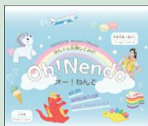
オー！ねんど 【ねんど教室でもよく使用する とっても使いやすい軽量ねんど】