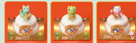
お鏡餅キャラクター 2024 年干支の「辰」、 「招き猫にゃあ」の全3種 (越後製菓)