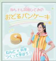
学習キット 形状記憶合金 LABO おどるパンケーキ (吉見製作所)