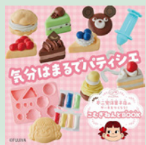
不二家洋菓子店の ケーキをつくろう！ こむぎねんど BOOK (宝島社)