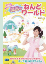
ねんど岡田ひとみの 魔法のねんどワールド (じゃこめてい出版)