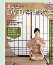
北見宗幸 DVD 茶道教室 裏千家 (山と溪谷社)