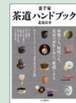
裏千家 茶道ハンドブック 北見宗幸著 (山と溪谷社)