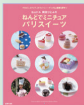
ねんど岡田ひとみの ねんどでミニチュア パリスイーツ (主婦の友社)