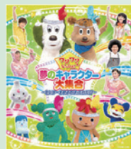
ワンワンといっしょ！ 夢のキャラクター大集合 ～センターを取るの、だれだ！？～ 【DVD&Blu-ray】(日本コロムビア)