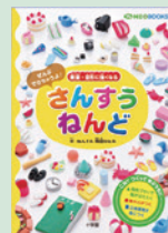
ブレ NEO ブックス さんすうねんど (小学館)