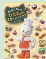
ねんどキャットひとみの まほうのレストラン 【いりやまさとし氏とのコラボ レーション絵本】(学研プラス)